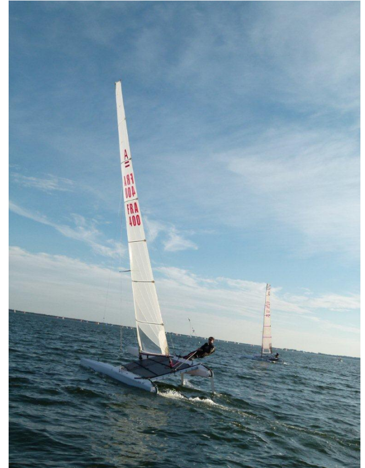
A Class in Maubuisson