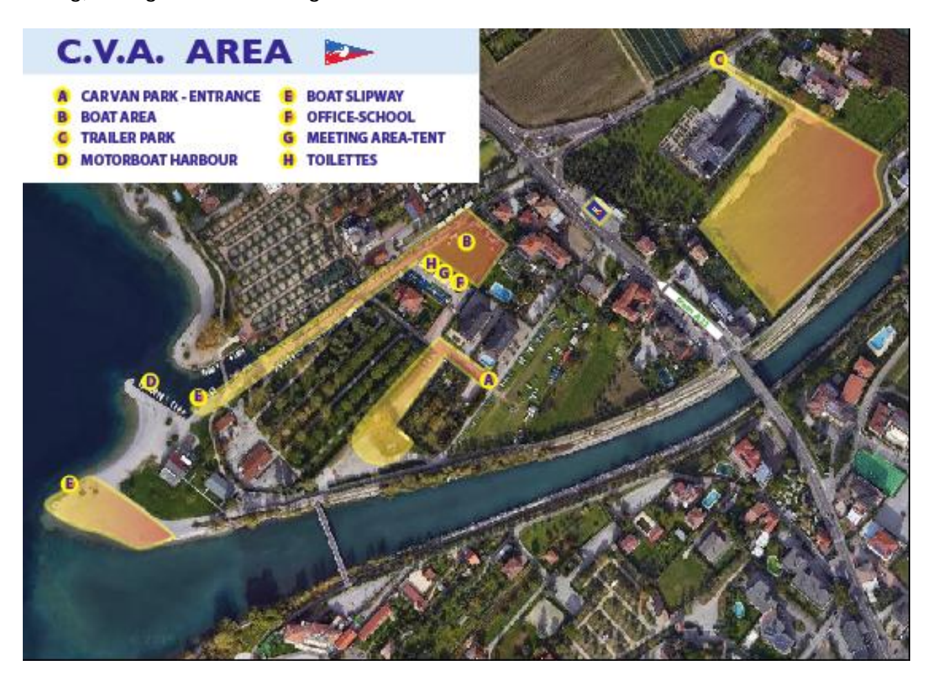
The Sailing Club is placed near the river Sarca. Is a perfect spot for sailors since 1983.

Famous destination for relax and spa cures and also world climbing capital and venue for world class competitions like World Rock Master. Arco has a dual personality, and you can have a quiet relaxing stay surrounded by a wide range of outdoor pursuits, including biking, sailing and windsurfing.